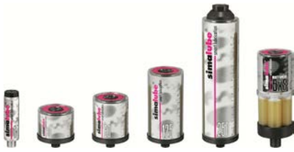
Selection of automatic single and multi-point lubricators.