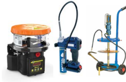
Centralized units for grease and oil distribution.