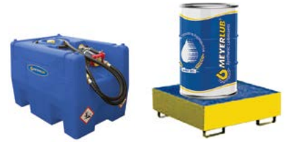
Lubricants transfer and storage equipment.