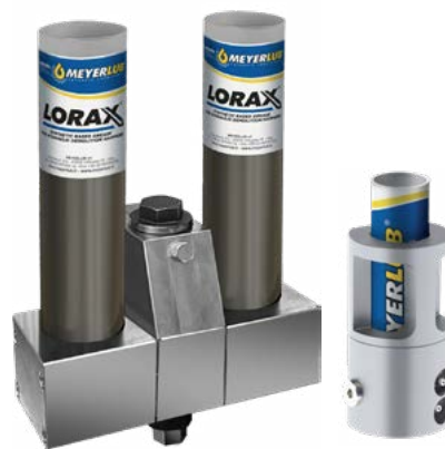
CARTRIDGES GREASING UNIT