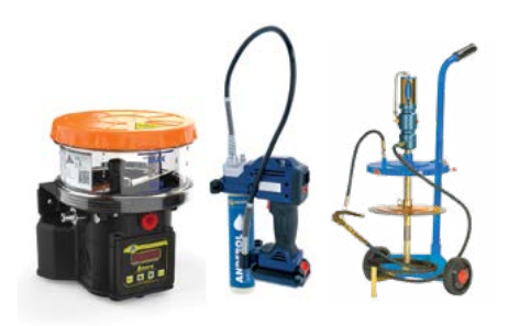
Centralized units for grease and oil distribution.