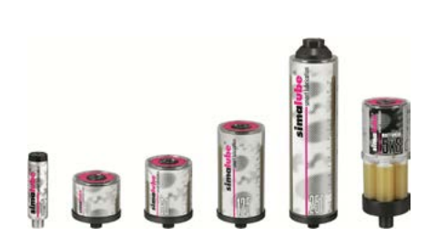
Selection of automatic single and multi-point lubricators.